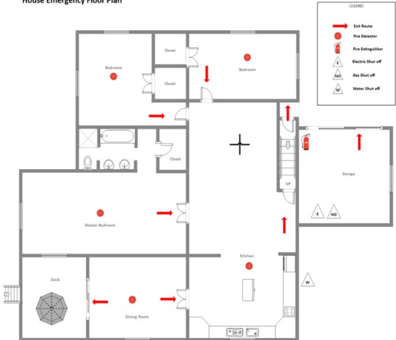
House Emergency Floor Plan